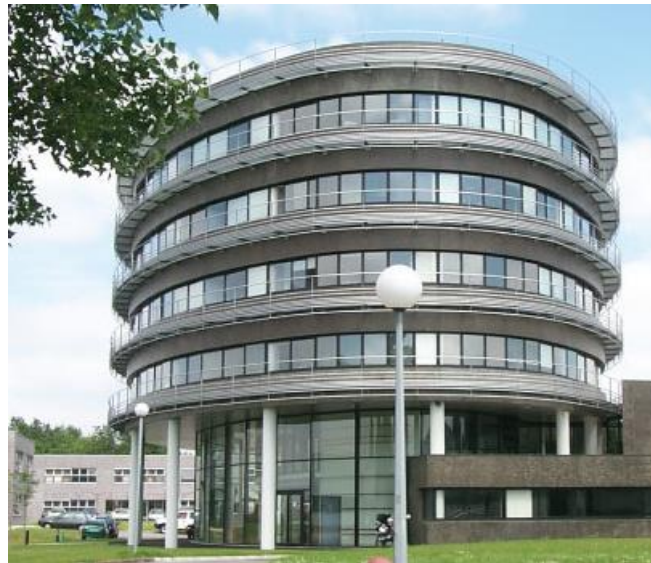
Building S on ECN campus

Room 018 is on the ground of the building S, at the right side of the building when entering into it.